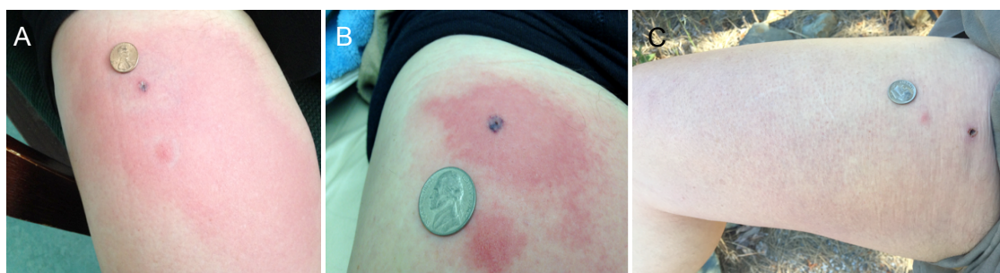
Figure 1: Photos show the extent of the cellulitis on presentation and 3 days post treatment.

While most tick bite cellulitis is thought to fall into the realm of Lyme disease, the mouth of any organism might carry any number and kinds of bacteria. Lyme “cellulitis” generally takes